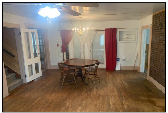
Dining area; wood floor