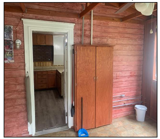
East entry room with wood